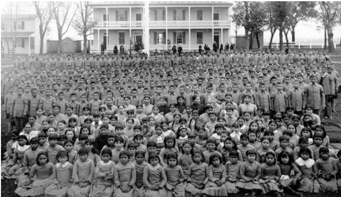
Carlisle Indian Industrial School circa 1895

This was due, in large part to the person who founded and ran one of the first, and surely the most influential, of the Indian Boarding Schools. That man, Captain Richard Henry Pratt, had served as an officer in the 10th Cavalry during the Red River War. When the war ended, Pratt was given charge of a group of 72 Indian prisoners of war taken in 1875 to Fort Marion in St. Augustine, Florida. His success in “transforming” them led to the development of the Carlisle Residential School Model. The first of such institutions, the Carlisle Indian Industrial School, was established in 1879 in Carlisle, Pennsylvania. Pratt’s philosophy was best described in a speech that he himself gave in 1892: “A great general has said that the only good Indian is a dead one.* In a sense, I agree with the sentiment, but only in this: that all the Indian there is in the race should be dead. Kill the Indian in him, and save the man.”