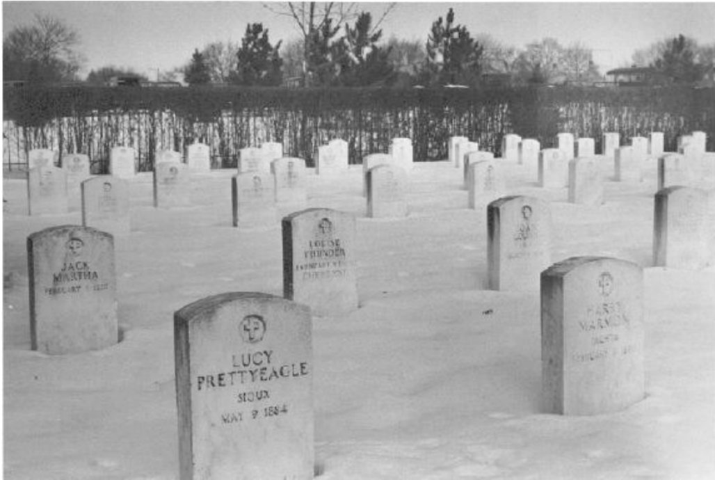
Carlisle Indian School graveyard (c. 1885)

had children of their own, were selected for Carlisle personally by none other than Pratt. Most of them died there of tuberculosis (and are buried in the Carlisle graveyard) or were shipped infected back to their families who then contracted the deadly disease.